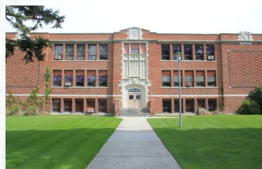
Raffles International School