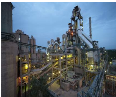
J K Cement